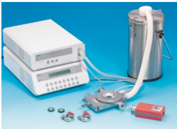
Figure 3. Freeze dry microscopy equipment. An ideal thermal stage allows for numerous key capabilities.

Without key formulation information, Otten says she and her colleagues could be delayed in working on portions of product because they did not want to damage the sample.