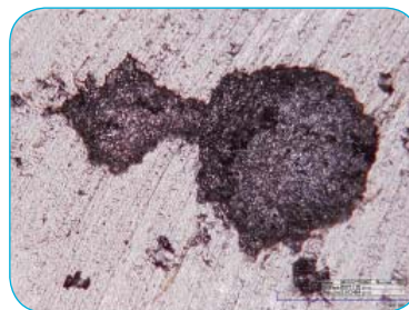
Image of a hole in cast iron. 50X.

The responsive Hirox KH-8700 delivers quick, accurate 2D/3D results.