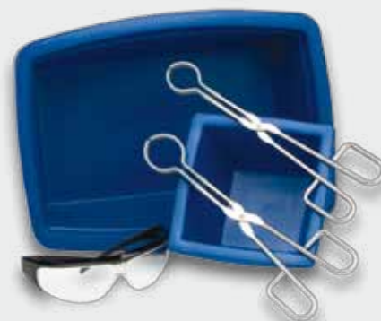
The CryoKit consists of: 2 insulated containers (1 and 4 liter), 2 pairs of grinding jar tongs 1 pair of safety glasses.

The screw-top grinding jars are particularly suitable for cryogenic grinding, as they remain hermetically sealed until they have regained room temperature. This prevents atmospheric humidity from condensing on the cold sample as water vapor which could penetrate the sample and falsify the analytical results. However, jars made from agate or ceramics should not be cooled with liquid nitrogen in order to avoid damages during the grinding process.