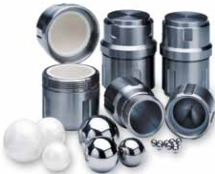
Screw-top grinding jars for MM 400

The grinding result is greatly influenced by the grinding tools. The choice of jar volume, ball charge and material depends on the type and amount of sample. In order not to falsify the subsequent analytical determination, a neutral-to-analysis material should be selected.